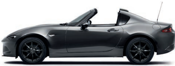
Machine Gray (46G)

The Machine Gray body colour was developed as part of Mazda's unique TAKUMI-NURI (TAKUMI: master craftsman, NURI: painting) painting technology, like the brand colour Soul Red. It achieves an unprecedented combination of colour, highlights, shade and depth to emphasize the dynamic body shape of KODO design, and makes MX-5 look as though it were carved from a single ingot of steel.