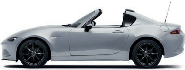
Ceramic Metallic (47A)