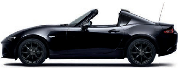
Jet Black (41W)