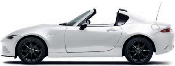
Snowflake White Pearl (25D)