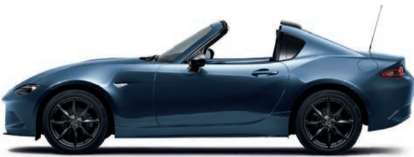
Eternal Blue (45B)