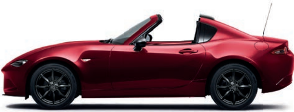
Soul Red Crystal (46V)

The Soul Red Crystal is one such new colour evolved from the original Soul Red. It yields an emotionally charged energy and vividness, and takes clear depth and lustre to a much higher level. Soul Red Crystal continues to use three coats a reflective layer, a translucent layer and a clear top coat - but represents a major advance in Mazda's TAKUMI-NURI painting technology.